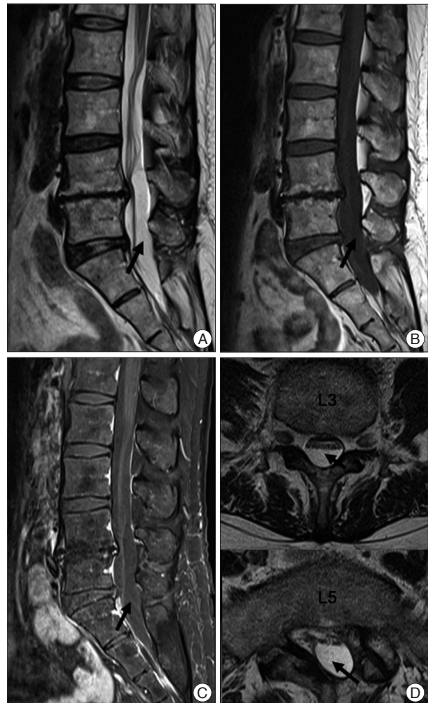
Fig. 3. Sagittal T2 (A), T1 (B), Gd-enhanced T1 (C) and axial T2 (D) weighted magnetic resonance imaging scans showing an intradural cystic lesion (black arrows), spanning from L2-3 to S2-3 level and displacing cauda equina anteriorly. The cyst fluid having the same signal intensity as cerebrospinal fluid.

After the endoscopic epidural neuroplasty, she complained of increase in the intensity of back pain (VAS : 9/10), over a wide area of low back. She was again put on pain medications for 2 weeks, but not much pain relief and it was decided to take MRI of the lumbosacral spine. MRI showed an intradural cystic lesion, 8 cm in length, spanning from L2-3 to S2-3 level and displacing cauda equina anteriorly, lesion was slightly herniated through the laminectomy defect of left L5. The cyst fluid had the same signal intensity as cerebrospinal fluid, in all the sequences (Fig. 3). She was admitted to our department. Computed tomography myelography confirmed the findings of intradural cyst on the MRI, and contrast media was partially filled up in the cystic cavity of the lower spines (Fig. 4). As conservative treatment did not provide any pain relief, surgery was planned. In operation, the patient was placed in prone position and partial laminectomy of L5 was performed. Opening the dura ma-