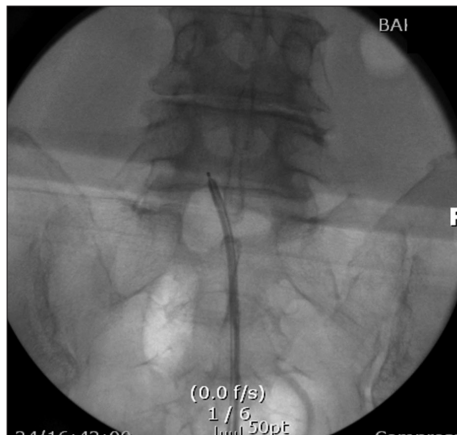
Fig. 2. A fluoroscopic view showing the endoscopic epidural neuroplasty. An epidural catheter is inserted into the epidural space of L5-S1 levels through the sacral hiatus. The tip of epidural catheter is located just around right L5 root.