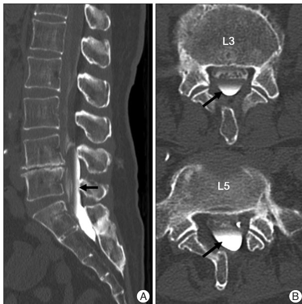
Fig. 4. Myelography-computed tomography images showing an intradural cyst spanning from L4-5 to S2-3 level (black arrow) (A). The contrast media is partially filled up in the cystic cavity of the lower spines (black arrows) (B).