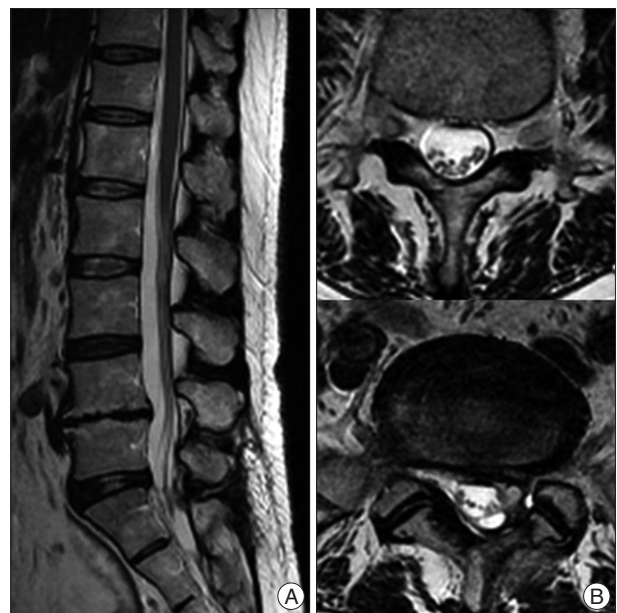
Fig. 6. Sagittal (A) and axial (B) postoperative magnetic resonance imaging scans showing complete disappearance of the intradural cyst.