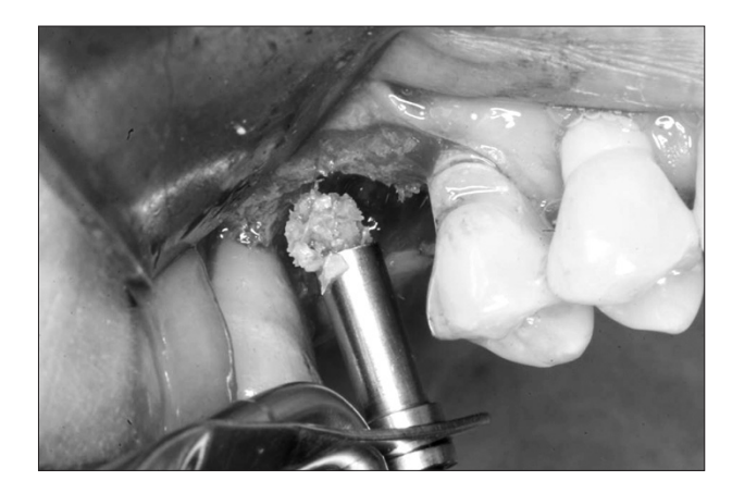
Fig. 2. Bone graft material was inserted under the elevated sinus membrane using amalgam carrier.

Hyung-Ju Lee et al: Multicenter clinical study on the hydrodynamic piezoelectric internal sinus elevation (HPISE) technique. J Korean Assoc Oral Maxillofac Surg 2012