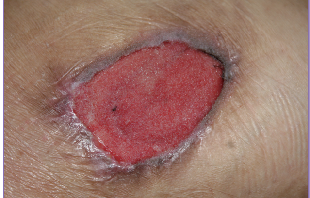
Fig. 4. Postoperative view (4 months later)

With antibiotics and negative pressure dressing therapy, infection and inflammation was controlled well and the ulcerative lesion was filled with healthy granulation.