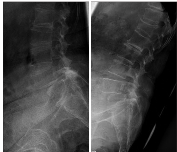
Fig. 1. Dynamic radiographs show spondylolisthesis at L5 on S1.

(Table 1). Our patient did not have any predisposing risk factors for pedicle fractures except severe osteoporosis. Osteoporotic bone loss resulting in material and structural changes of the bone leads to an increased risk of stress fractures due to the weakened structure of the spinal bones. Tabrizi and Bouchard 10 reported axial osteoporosis caused stress fractures of the pedicles and produce a spondylolisthesis in the 73-year old female patient. Stress fractures can develop after minor trauma or even in