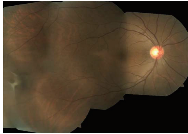
Fig. 2. Inflammatory membrane over the retina as seen by fundus photography in the patient.