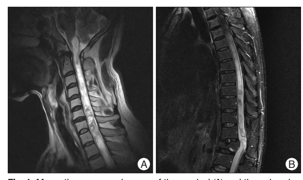
Fig. 1. Magnetic resonance images of the cervical (A) and thoracic spine (B) reveal the presence of a huge syrinx extending from the medulla to the L1 level.

have limitations<sup>2,3,9,13,15,16</sup>). Spouros and Williams observed that a large proportion of patients with syringe-pleural shunts needed subsequent surgery within one year. They also observed a high number of postoperative neurological complications<sup>13</sup>), Batzdorf