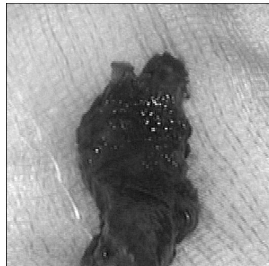
Fig. 4. A floating lesion in the aortic arch in the operating room. A fibrin thrombus was reported from the biopsy.

peripheral embolization, including thrombectomy for the brachial and radial artery occlusion of the left arm. We inserted arterial cannulation in the left femoral artery. A median sternotomy was performed, a venous cannula was inserted in the RA auricle, extracorporeal circulation was begun, and the central temperature was decreased to 25°C. The patient was then in total circulatory arrest. An incision was made in the aortic arch, and the 3.0-cm intraaortic mass was completely removed (Fig. 4). The mass had no definite stalk, and its attachment site in the aorta was relatively normal. A histopathologic examination revealed the mass to be a fibrin thrombus. We also removed the thrombus of the left upper extremities through the brachial artery. In the postoperative peripheral angiography, the brachial artery and the radial artery showed good blood flow (Fig. 1). One week later, the patient recovered without complications and was discharged