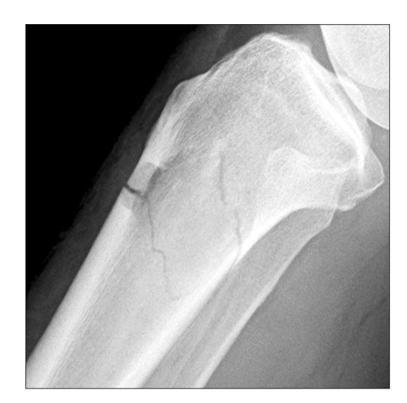
Fig. 6. Case 2, tibial fracture. Il-Kyu Kim et al: Tibial bone fractures occurring after medioproximal tibial bone grafts for oral and maxillofacial reconstruction. J Korean Assoc Oral Maxillofac Surg 2013

Patient 3 was a 53-year-old, 55.6 kg male who underwent tibial graft surgery due to a maxillary dentigerous cyst.(Fig.