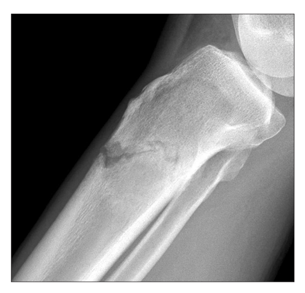
Fig. 4. Case 1, splint removal. Il-Kyu Kim et al: Tibial bone fractures occurring after medioproximal tibial bone grafts for oral and maxillofacial reconstruction. J Korean Assoc Oral Maxillofac Surg 2013

Patient 2 was a 63-year-old, 56.6 kg female. She underwent right tibial graft surgery due to a mandibular radicular cyst.