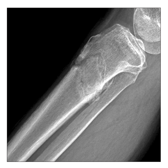
Fig. 8. Case 2, splint removal. II-Kyu Kim et al: Tibial bone fractures occurring after medioproximal tibial bone grafts for oral and maxillofacial reconstruction. J Korean Assoc Oral Maxillofac Surg 2013