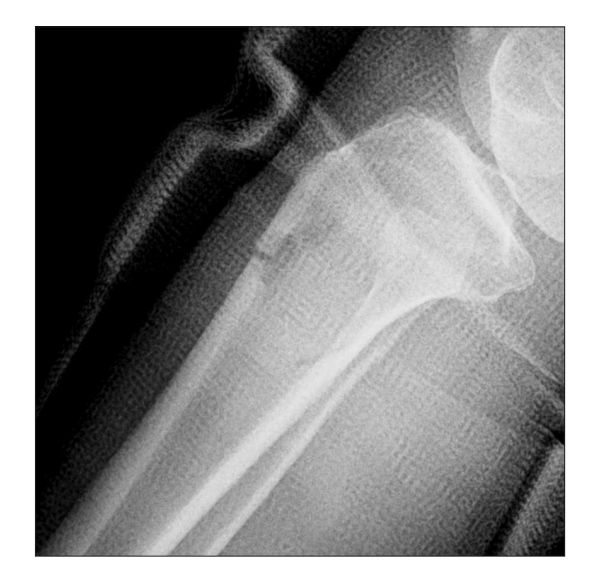
Fig. 7. Case 2, noninvasive reduction of the fractured tibia. Il-Kyu Kim et al: Tibial bone fractures occurring after medioproximal tibial bone grafts for oral and maxillofacial reconstruction. J Korean Assoc Oral Maxillofac Surg 2013