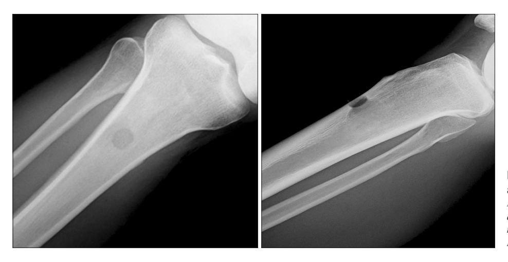
Fig. 1. Case 1, tibial antero-posterior and lateral views after grafting. Il-Kyu Kim et al: Tibial bone fractures occurring after medioproximal tibial bone grafts for oral and maxillofacial reconstruction. J Korean Assoc Oral Maxillofac Surg 2013

Patient 1 was a 46-year-old, 68.2 kg male. He underwent right tibial graft surgery due to an oroantral fistula.(Fig. 1)