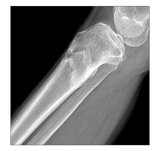
Fig. 9. Case 2, six months after tibial fracture. II-Kyu Kim et al: Tibial bone fractures occurring after medioproximal tibial bone grafts for oral and maxillofacial reconstruction. J Korean Assoc Oral Maxillofac Surg 2013