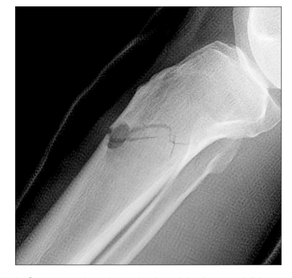
Fig. 3. Case 1, noninvasive reduction of the fractured tibia. II-Kyu Kim et al: Tibial bone fractures occurring after medioproximal tibial bone grafts for oral and maxillofacial reconstruction. J Korean Assoc Oral Maxillofac Surg 2013