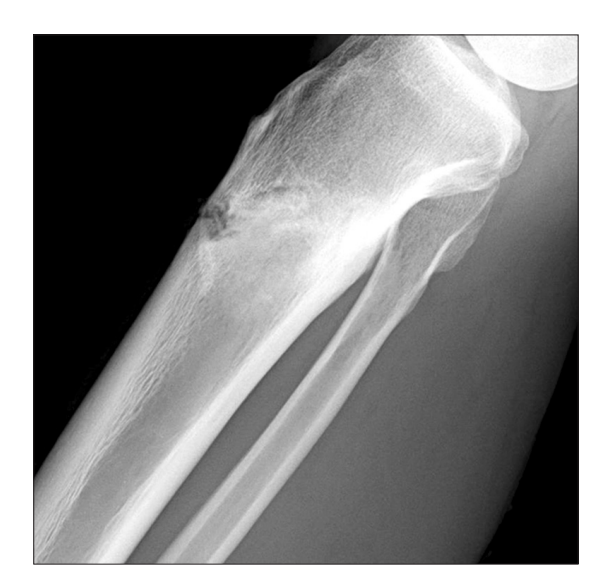
Fig. 5. Case 1, six months after tibial fracture. Il-Kyu Kim et al: Tibial bone fractures occurring after medioproximal tibial bone grafts for oral and maxillofacial reconstruction. J Korean Assoc Oral Maxillofac Surg 2013