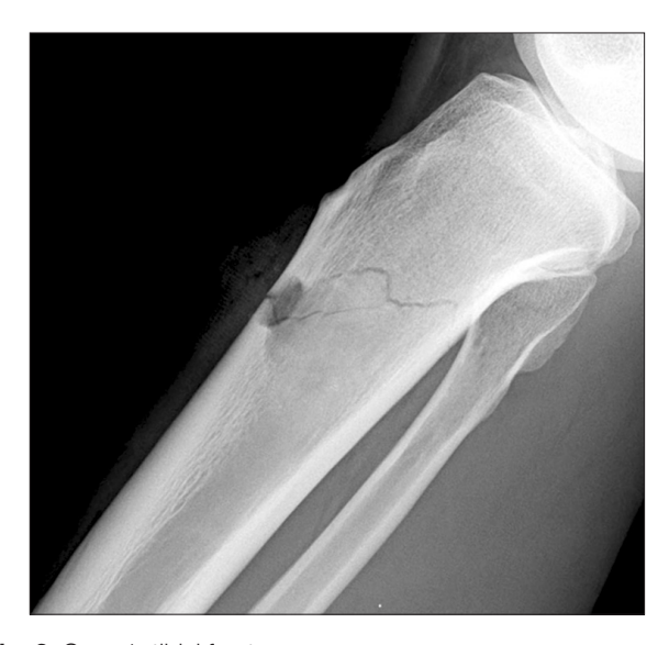
Fig. 2. Case 1, tibial fracture. Il-Kyu Kim et al: Tibial bone fractures occurring after medioproximal tibial bone grafts for oral and maxillofacial reconstruction. J Korean Assoc Oral Maxillofac Surg 2013