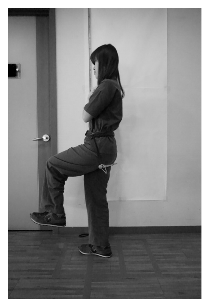
Figure 3. Testing position for single leg squat.

The jump has been used as assessment tools of rehabili-