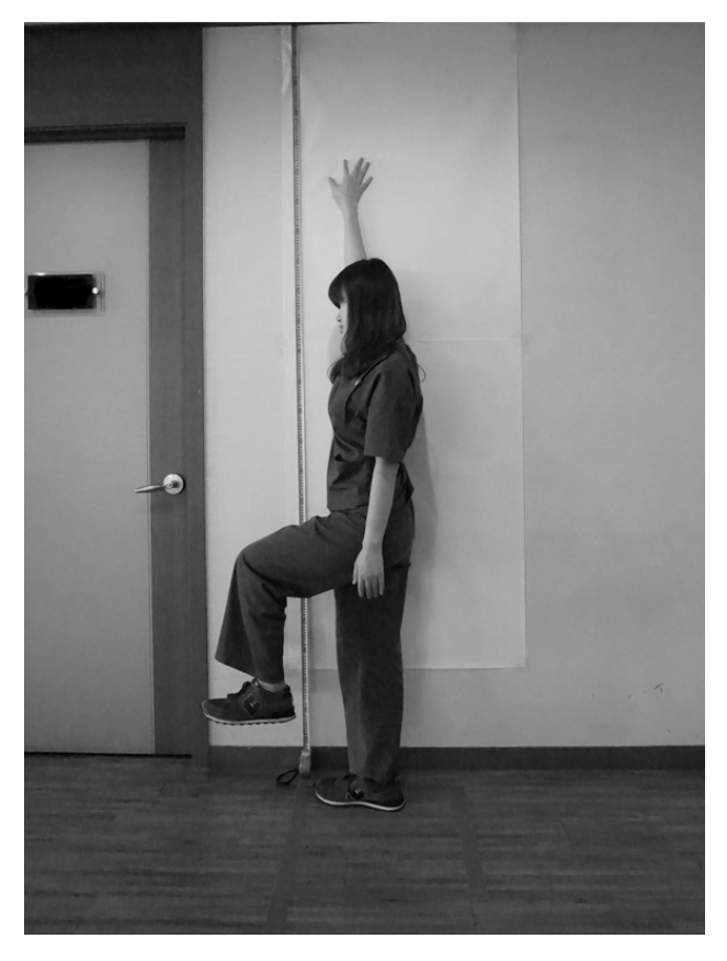
Figure 1. Testing position for single leg vertical jump.

For SLVJ, 1) it was recommended that stand on one leg, unsupported, next to a wall and tap your hand on the wall at the maximum vertical height. 2) At takeoff, the participant jumped as high as possible, tapping your hand on the wall at the maximum vertical height and landing on the same