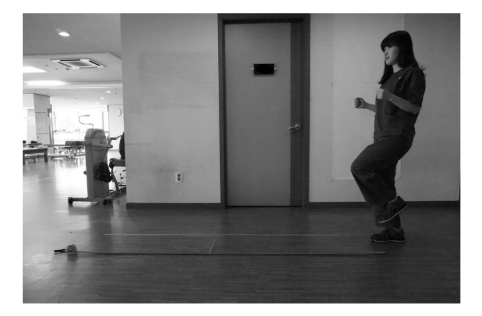
Figure 2. Testing position for single leg hop for distance.

IBM SPSS Statistics 19.0 (IBM Co., Armonk, NY, USA) was used for statistical analysis, by way of t-test with the sig-