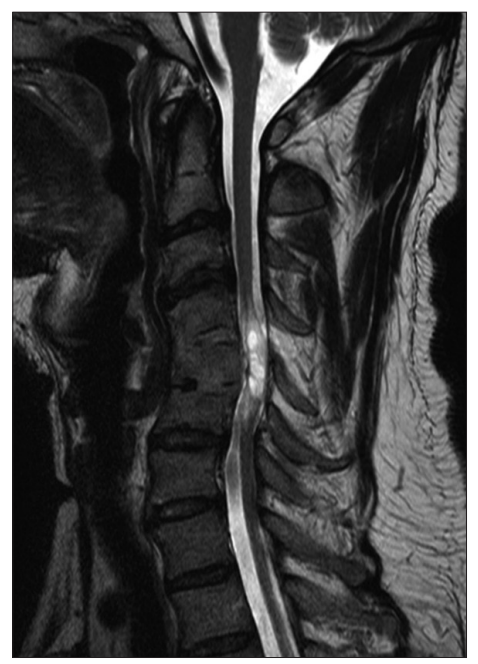
Fig. 1. A sagittal T2-weighted magnetic resonance image of the neck show traumatic destruction of spinal cord at C4-C6.