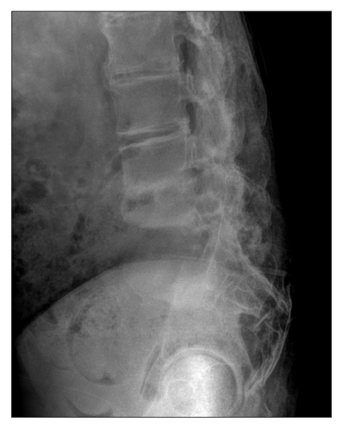
Fig. 2. Plain Lateral radiographs showing bony destruction of the L5 and S1 vertebral bodies.

functional outcome. Moreover, the patient refused a surgery because of the absence of malignancy. An external support with a body jacket molded for sitting was also suggested but the patient refused. Hence, we were only able to implement regular clinical and radiological monitoring. During follow-up no specific changes were observed after discharge.