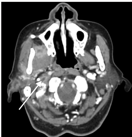
Fig. 2. Contrast-enhanced neck computed tomography showing thrombosis in the right sigmoid sinus (arrow). Taeyun Kim et al: Lemierre syndrome with thrombosis of sigmoid sinus following dental extraction: a case report. J Korean Assoc Oral Maxillofac Surg 2013

To treat severe infection in the right masticatory and parotid areas, amoxicillin clavulanate 1.2 g was administered intravenously every 8 hours in addition to metronidazole 500 mg every 12 hours.