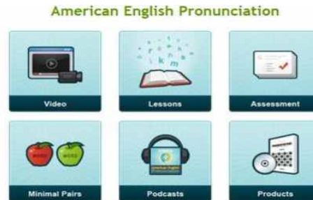
(Figure 1) Application Pronunciation

The main categories (Sounds, Stress, Linking, Pitch) at the top of the blue menu can be moved; clicking on the logo in the upper left corner or these icons—Video, Lessons, Assessment (pronunciation test), Podcast, will move you to the main page of the website.