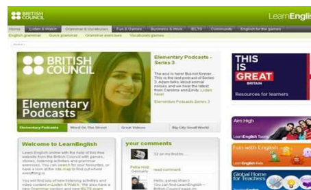
(Figure 2) Learn English Web

The British Council offers several kinds of resources for English language learning for people who have these goals; to improve business English; to attain advanced level English; to work at foreign companies where English is required.