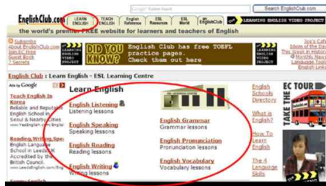
(Figure 8) EnglishClub

www.englishclub.com is a free online English language learning website that allows the learners to improve their English skills through a variety of activities. The materials provided are useful not only for students who want to learn English but also for English teachers .