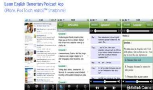
(Figure 6) Podcast App

This educational site enables learners to enhance English language skills through interesting episodes, games, and a variety of multimedia activities that it provides.