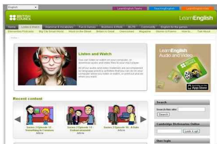
(Figure 3) Audio and Video

This website offers activities that can be done alone, but it is also structured to be performed with friends, parents, teachers making it more effective.