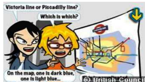
(Figure 7) Big City Small World( iPhone 3G, 3GS, iPod Touch)

Learning English Elementary Podcast App is an app for English learners with basic skills. The learners can listen to a conversation between Tess and Ravi that continues for 20 minutes then practice speaking by answering the provided questions. In addition, by using the provided script, the learner can practice listening.