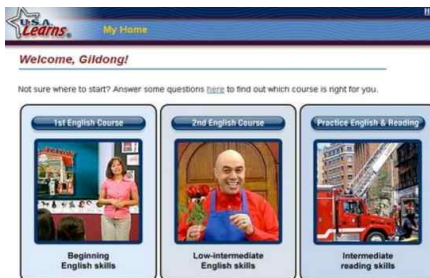
(Figure 5) USALearns

project, unlike most commercial websites, is very simple in design.