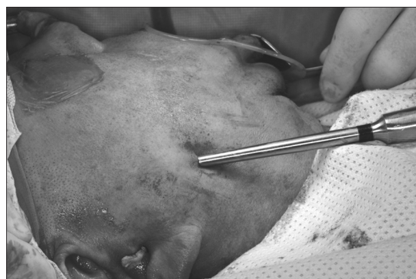
Fig. 2. Successful reduction of the right intact condyle was performed by applying external force with bone traction hook via stab incision at the level of sigmoid notch of the same side. Bong Chul Kim et al: Reduction of superior-lateral intact mandibular condyle dislocation with bone traction hook. J Korean Assoc Oral Maxillofac Surg 2013

Allen and Young 2 classified the lateral dislocation of the