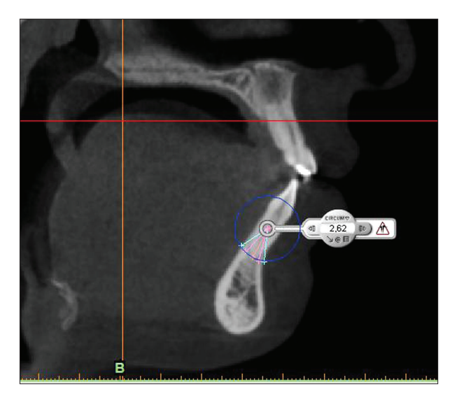
Figure 3. Arch length measurements.

Class II groups. The Kruskal–Wallis test and Dunn post-hoc test was used for subgroup comparisons. Statistical significance was tested at \alpha = 0.05 .