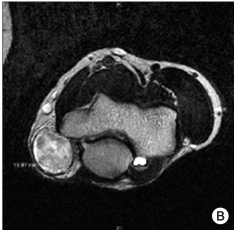
Fig. 1. (A) Axial T1-weighted image showed ovoid mass with low signal intensity which is isointense to surrounding muscle. (B) Axial T2-weighted image showed ovoid mass with high signal intensity. Compose of hypointensity on marginal area and hyperintensity on central area