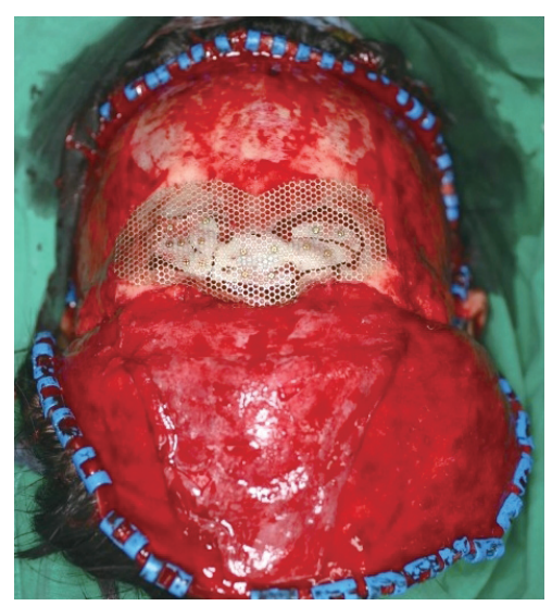
Fig. 3. The anterior wall of frontal sinus was remodeled by repositioning and fixation with mesh plate and screws.

The postoperative slope angle of the forehead was 12°, which was 7° less than the preoperative measurement (Fig. 1B). The patient was able to resume activities of daily life, including hair washing, on the first day after operation. At postoperative week 3, cephalometry revealed a flatter forehead (Fig. 2B). During the 36-month follow-up period, there were no signs of infection such as chronic frontal sinusitis.