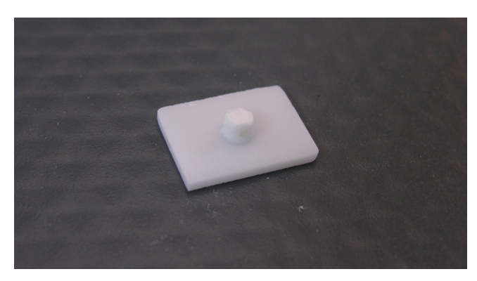
Fig. 1. A test sample with 3 mm thick veneer layer before shear bond strength testing.