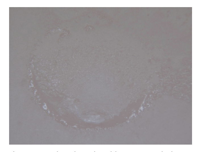
Fig. 3. A sample with combined fracture type which is the main mode observed among the samples including both adhesive and cohesive failure.

After the SBS test, fracture modes were examined by optical microscopy (Olympus SZ4045 TRPT) at magnifications of 10 \times and 20 \times , to determine the types of failure. Photographs of the surfaces were also taken, and fracture types were classified as "cohesive", "adhesive", (Fig. 3).