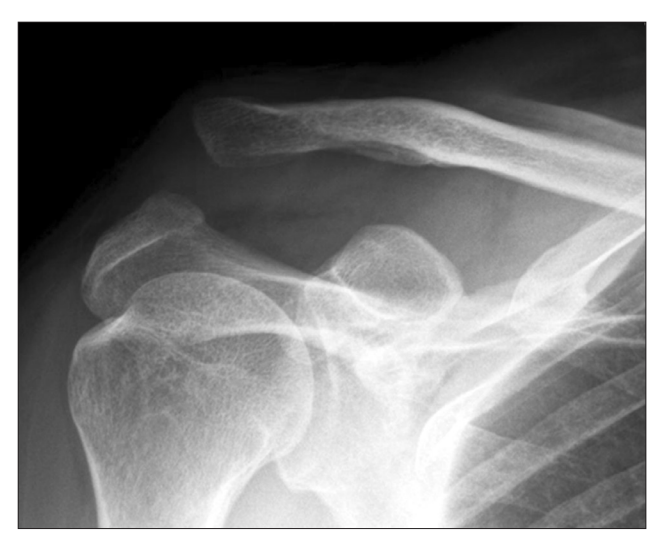
Fig. 1. Rockwood type {\rm V} acromioclavicular dislocation was found on plain radiograph.