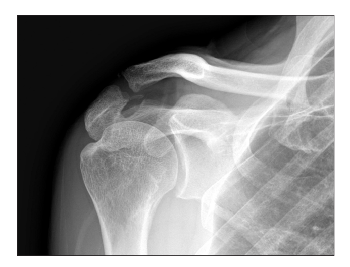
Fig. 6. Complete bony union of the previously fractured acromion was confirmed by plain radiograph.

arise from nonsurgical treatment, such as chronic pain and deformation.<sup>4,5)</sup> Numerous surgical methods have been described as understanding of shoulder joint biomechanics has increased, and coracoclavicular repair and intra-articular AC fixation are currently the most popular surgical methods for stabilization.