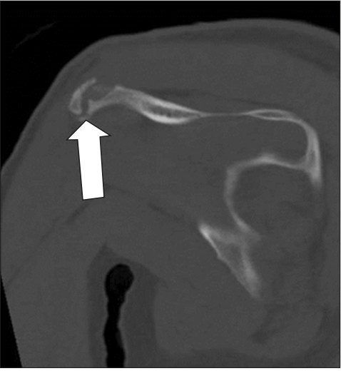
Fig. 5. The anterior and superior fracture gaps (white arrows) were much wider as seen on axial and coronal computed tomography images.