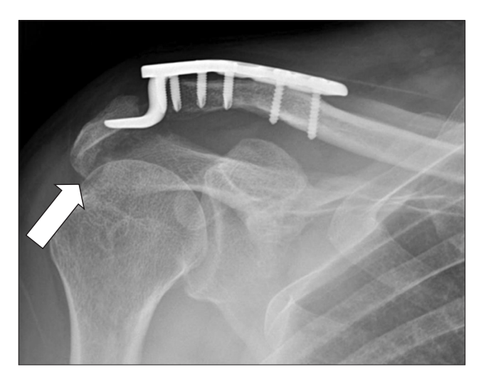
Fig. 4. Widening of the radiolucent line (white arrow) at the acromion was seen and the hook of the plate had cut through the fracture of the acromion.

plate removed because he had no pain. After the removal, the patient underwent computed tomography (CT) imaging to get a more accurate evaluation of the fracture. The fracture had a considerable gap, especially at the anterior and superior fracture sites (Fig. 5). Two months after removal of the hook plate, the patient regained full range of motion of the shoulder without pain. Plain radiographs taken two years after the removal revealed complete bony union of the fracture (Fig. 6) and his right shoulder recovered so completely that the patient could engage in joint-intensive exercises, such as chin-ups, without any pain.