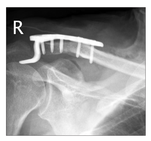
Fig. 2. Immediate postoperative radiograph showed a well-reduced acromioclavicular joint.

pain in the right shoulder; he reported no further trauma, and a subtle radiolucent line in the acromion on plain radiograph was noted (Fig. 3). We prescribed oral analgesics and recommended he stop his exercise regimen. By eight weeks post-surgery, the pain subsided and he complained of protrusion in the area around the posterior acromial border. A new plain radiograph revealed that the radiolucent line at the acromion had widened and the plate hook had cut through the fracture of the acromion (Fig. 4). The patient did not complain of pain, and did not experience any tenderness at the fracture site.