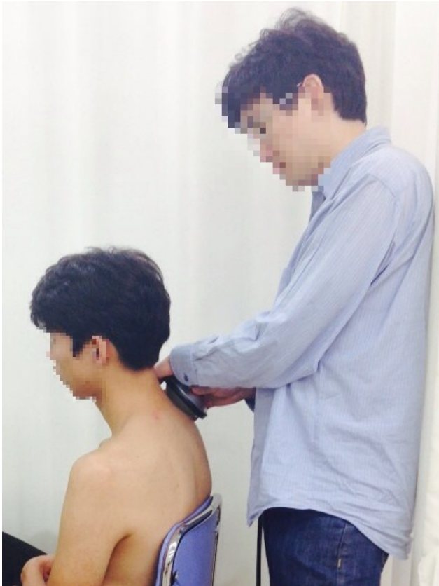
Figure 1. Extracorporeal shock wave therapy application.

number of shock wave was applied to anterior and posterior 500 pulses respectively, total 1,000 pulses received (Figure 1). Lastly, the PPT and VAS was measured again after treatment.