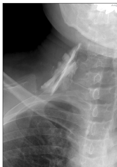
Fig. 1. Contrast imaging using 3.5 ml of contrast injected via the ultrasonography-guided interscalene brachial plexus block procedure in a volunteer. The image shows that the contrast has spread favourably close to the nerve root.

Changes in VAS scores at each of the observation points were compared with one-way repeated measures