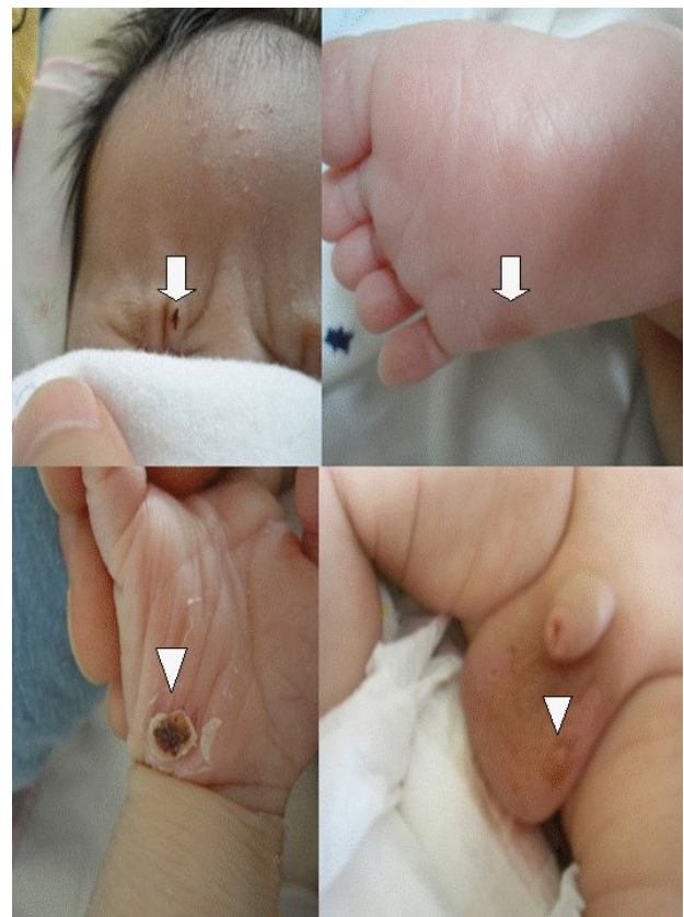
Fig. 1. On admission multiple ulcerative papules with crust and desquamation on the right eyelid and palm and erythematous macules and papules on the right sole were identified in addition to ulcerative papules and vesicles on the scrotum.

The patient's cerebrospinal fluid examination revealed values within normal limits (protein 54 mg/dL, glucose 82 mg/dL) and was negative for VDRL, bacterial and fungal culture, not including pleocytosis