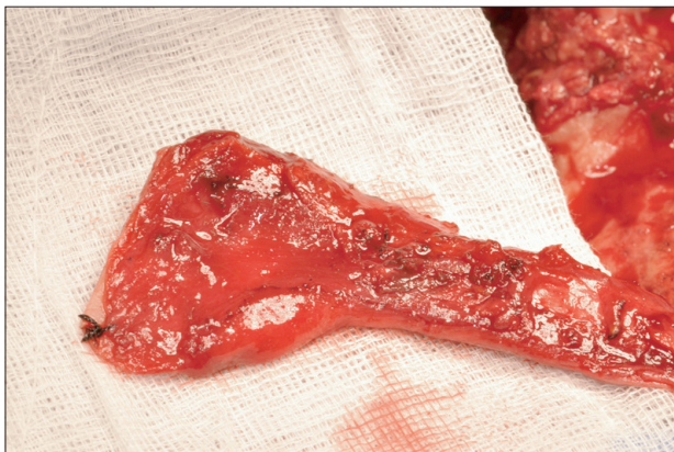
Fig. 2. Vascularized calvarial bone was harvested.