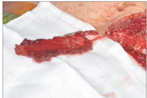
Fig. 3. Ipsilateral fourth rib was harvested.