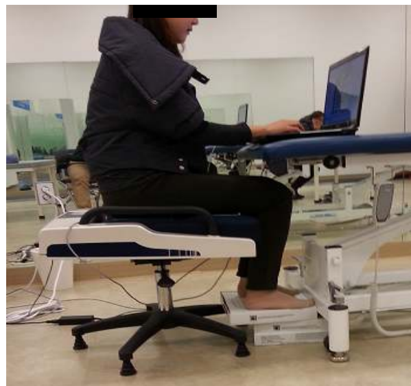
Figure 3. Simulated typing station, with subject sitting on the Baltube.

The participants did not wear shoes during the experiment. An experimental work station was created for the typing task. Before subjects sat on the Baltube seat, all air chambers (first to fourth) of the seat were set at 20 mmHg. The investigator adjusted the subjects' sitting position to a neutral pelvic position (0° of coronal and sagittal plane). Subjects were asked to maintain the thoracic spine in a relaxed and comfortable sitting posture and to not change the position of their buttocks. The height of support of Baltube was 43 cm. The hip and knee angles of the subjects were maintained about 90°. Wood box was placed under the feet for adjusting hip and knee position for short subjects. Subjects were asked to sit with right and left ischium placed on the first and third air chambers and investigator confirmed the ischium position. Participants' elbows were held an angle of 90~100° during typing (Gadge and Innes, 2007) and they were asked to maintain their head