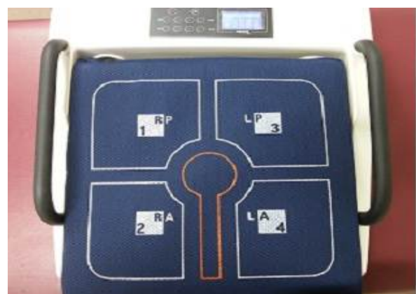
Figure 1. Pressure mat.

Pressure mat (Baltube, RELIVE, Gimhae, Korea) is a pressure measurement device used while sitting. The size of the mat is 25 cm × 25 cm × 7 cm, and it is divided into four air chambers. The first chamber is the right buttock side, the second chamber is the right thigh side, the third chamber is the left buttock