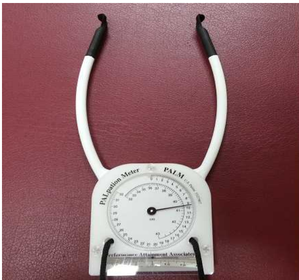
Figure 2. Palpation meter.

The palpation meter (PALM, Performance Attainment Associates, USA) was developed to measure pelvic angle in the sagittal and coronal planes (Figure 2). Intraclass correlation coefficients suggest that intratester reliability was high for both coronal (.84) and sagittal plane measures (.98), and intertester reliability was high for sagittal plane measures (.89) but moderate for coronal plane meas-