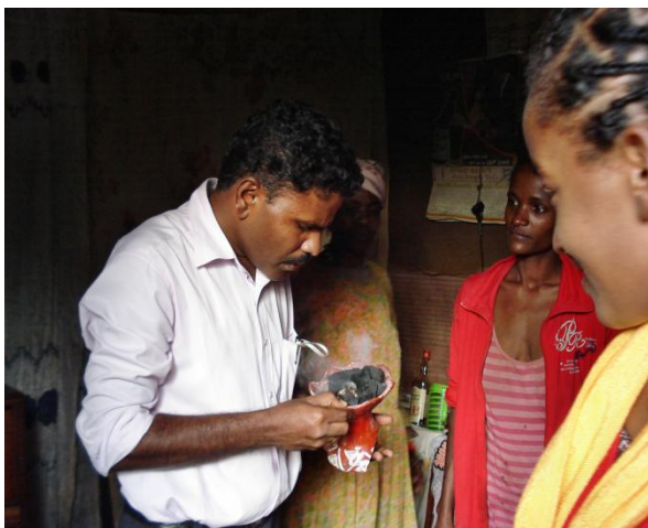
Fig. 2. An Ethiopian women describing about the traditional usage of repellent plants by means of smoldering/burning on the traditional charcoal stove.

residents have been using O. integrifolia as a potential traditional medicine to alleviate various illnesses and disorders (Kidane et al., 2013; Teklay et al., 2013) and insect repellent (Karunamoorthi et al., 2009a, b) to drive-away insects particularly mosquitoes by burning the dried plant parts as well as by hanging the plant around the main doors, windows and nearby sleeping cots in the early evening hours in Eretria (Waka et al., 2004).