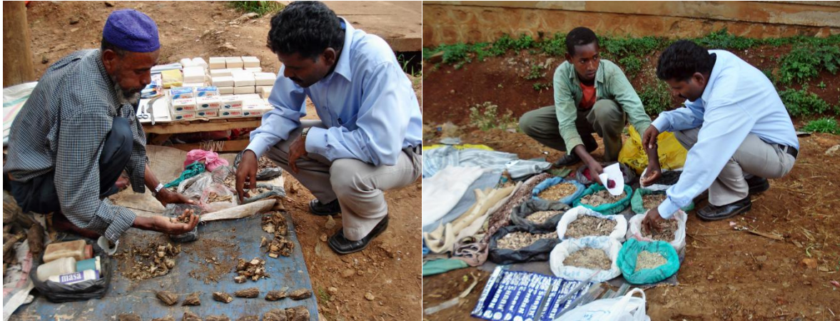
Fig. 3. Ethiopian vendors selling their repellant plants in the market of the Jimma town, Ethiopia .

biological marker to guarantee the quality of the herbal product. Therefore, O. integrifolia may serve as potential candidates for the development of efficacious as well as safe phytomedicines (Endale et al., 2013).