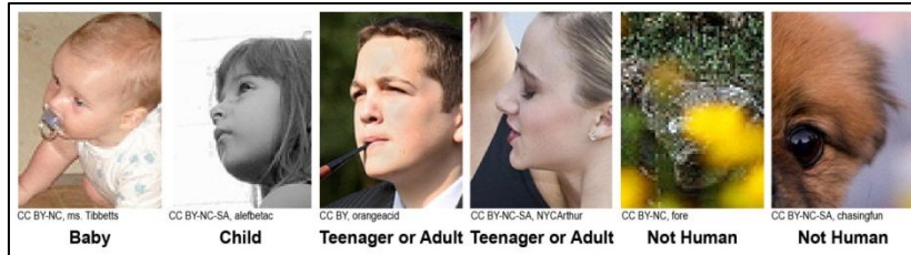
Fig. 5. Examples of the new test images generated by AgeCAPTCHA