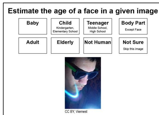
Fig. 2. Interface of AgeCAPTCHA

The second type of response category is required to identify the false positives. There are two types of false positives to consider. One type consists of images that do not contain any human-related information, such as images of mannequins, animals, buildings, vehicles, and so on. The other type consists of images that contain human body parts except for faces. To filter these false positives, we added Not Human and Body Part to our response categories. In particular, Body Part was also included in the 2010 version of the list of visual concepts for image annotation 8 , which is used to annotate the MIRFLICKR-25000 image collection, and hence, the need for that category underwent verification once again.