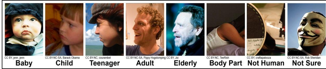
Fig. 3. Examples of the annotated age-indeterminate faces

Most of the age-indeterminate faces (776 images) were human faces (Baby, Child, Teenager, Adult, and Elderly), whereas Not Human and Body Part images (false positives) were relatively few. This was expected because the age-indeterminate faces were extracted by the state-of-the-art face recognition engine. Only 34 images could not be identified by our subjects and thus were annotated as Not Sure. Among the human faces, the Adult faces were the largest in number, followed by Teenager, Child, Elderly, and Baby. However, as there was no ground truth for the age-indeterminate faces, it was difficult to verify the accuracy of the annotation results. Alternatively, we evaluated the annotation reliability by measuring the consistency of the responses to each image. Table 2 summarizes the results.