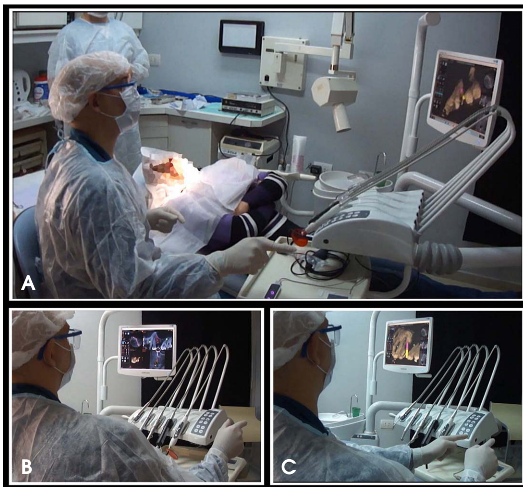
Fig. 2. A. Photograph shows the general view of use of the natural user interface that enables touchless control of the imaging system and helps to maintain the surgical environment during surgery. The system can be controlled with two fingers of one hand (B), or one finger of each of the two hands (C) can be used to control the images by two points (for modification of scale, zooming, or rotation).

avoid fatigue during the gestures. Different light conditions were tested to verify whether the controller performance was affected. The data transfer rate of the universal serial bus (USB) line and hub was checked. Different Leap Motion control settings were tested for a smooth and stable interaction, and the proposed system was set at 42 fps with a processing time of 23.2 ms; the interaction height was set as automatic. Touchless application (Leap Motion Inc., San Francisco, USA) in advanced mode was used.