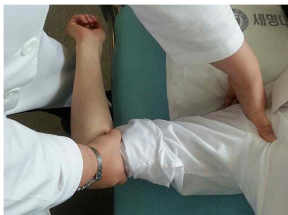
Fig. 1. Supine scapulohumeral joint traction

Participants lies supine position. Doctor stands on the affected side of the patient's. Main hand is positioned affected side distal upper arm of the patient. Auxiliary hand placed in front of the shoulder. After a fixed shoulder, traction from the inner to outer side of the upper arm(Fig. 1).