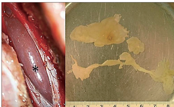
Fig. 2. Intraoperative photographs showing the cystic lesion observed after opening the dura (asterisk). The removed cyst was an oval-shaped yellowish lesion.