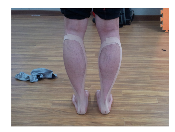
Figure 5. Y-taping method.

muscle, and the ends of Y-type tape were attached together (Figure 5).