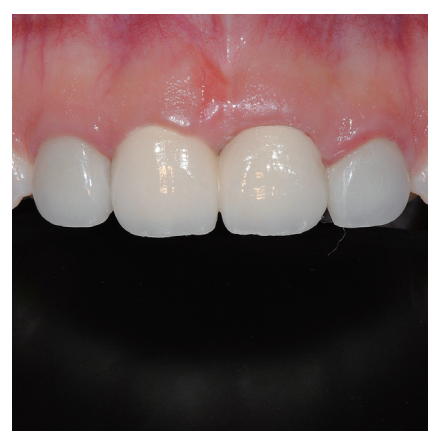
Figure 8. Labial aspect of the porcelain-fused gold restoration at delivery.