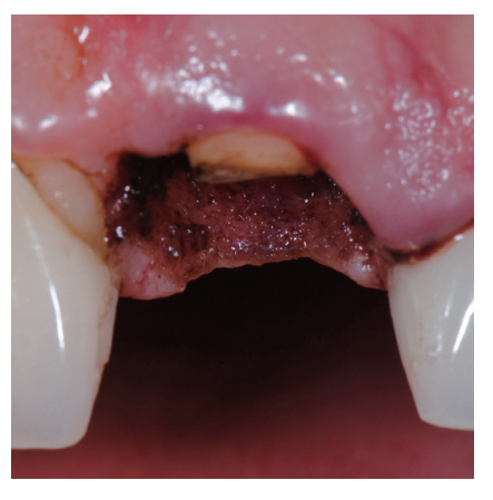
Figure 2. Subgingival fractured left central incisor and inflamed condition of gingiva.