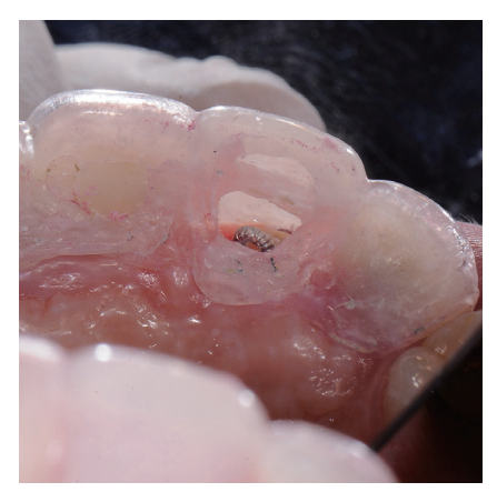
Figure 3. Palatal view of the braided fiber-reinforced composite strip bonded inside the clear appliance.