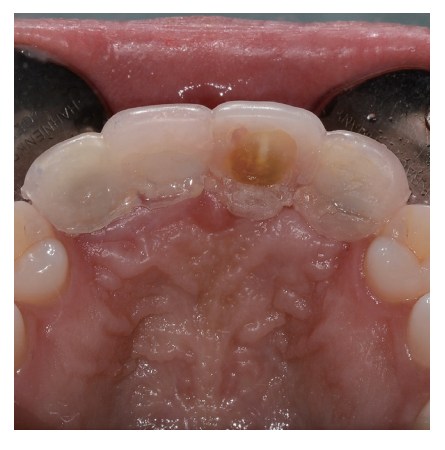
Figure 5. Temporary material covering the window of the palatal surface, leaving the inner space empty.