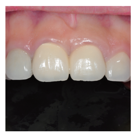
Figure 9. Labial aspect of the restoration at 24 months.