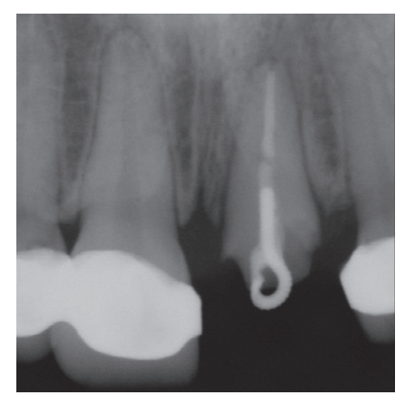
Figure 7. Three weeks after forced eruption, a 3.5 mm eruption for biologic width was achieved.