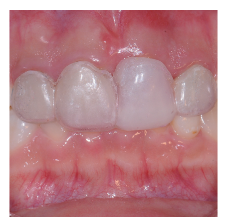
Figure 6. Labial aspect of a modified appliance.