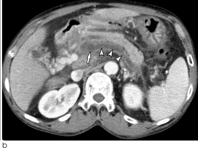
Fig. 1. Contrast enhanced CT. a. A 4 cm pseudocyst (asterisk) in the region of neck of the pancreas. b. Fluid density is seen within the thrombosed superior mesenteric (arrow) and splenic veins (arrowheads) without contrast enhancement. c. Fluid density is also seen within the main portal vein (arrow) and the right portal vein (arrowheads) is completely thrombosed. Cavernous transformation around the