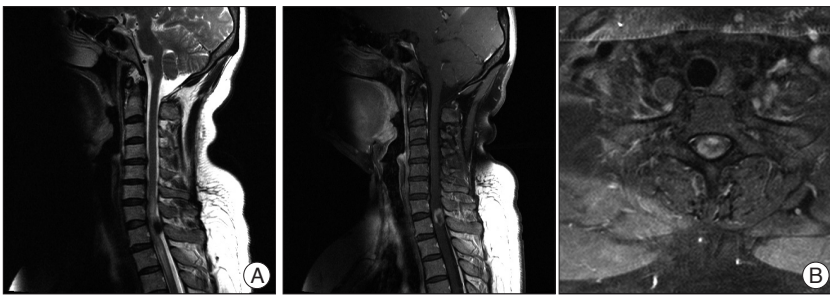
Fig. 1. Preoperative magnetic resonance image of the cervical spine. A 1.7×1.4-cm lobulated mass in the C7-T1 dorsal space. A low-signal-intensity elliptical lesion on a T2-weighted image (A). Peripherally enhanced lesion on a gadolinium-enhanced T1-weighted image (B).

Most of histopathologic subtype of non-dural-based spinal meningiomas was clear cell meningioma (15 cases)<sup>2-4,6,8,11,13,14,16,18,20-22)</sup>, whereas the remaining three cases were angiomatous, transition-