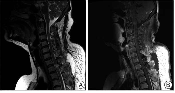
Fig. 4. Magnetic resonance image 1 week postoperatively. T2-weighted (A) and gadolinium-enhanced T1-weighted image (B). No residual tumor is detected.

al, and meningotheliomatous meningiomas<sup>9,17,19</sup>. The clear cell meningiomas were quite predominant, as high as approximately 83.3%. In several cases of clear cell meningioma, complete total resection with postoperative radiotherapy was considered because of high recurrence rate<sup>4,13,22)</sup>. Therefore, in cases of non-du-