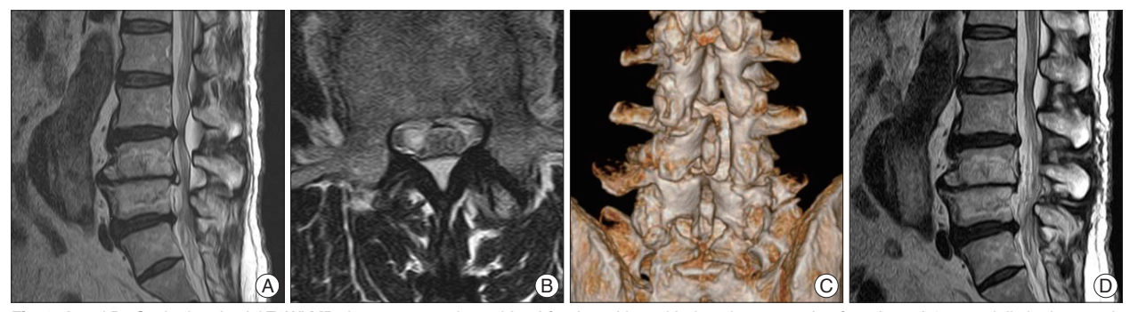
Fig. 3. A and B: Sagittal and axial T2WI MR show an extensive epidural fat deposition with thecal compression from L2 to L4, especially in the anterior aspect of right L4 body. C: Right L4 hemi-laminectomy, L4–5 discectomy and debulking of the epidural fat, especially on the right anterior aspect of the L4 body were performed. D: The postoperative MRI reveals a greatly reduced epidural fat, distinctive visualization of the decompressed sacral sac. and L4 root.

L4–5 spinal stenosis, due to a protruded disc and ligamentum flavum hypertrophy, was also seen. Right L3 hemipartial laminectomy and L4 total laminectomy with the interbody fusion on L4–5 were performed for the treatment of underlying spinal stenosis (Fig. 2C). The fat above and below the laminectomy level was scraped out with a hook. Postoperative MRI revealed much reduced epidural fat with decompression of the thecal sac (Fig. 2D). After the operation, the patient improved immediately and one year after follow-up.