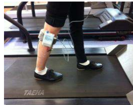
Figure 2. Dynamic FES (WalkAide2).

methods (Bugane et al, 2012; Pau et al, 2014).