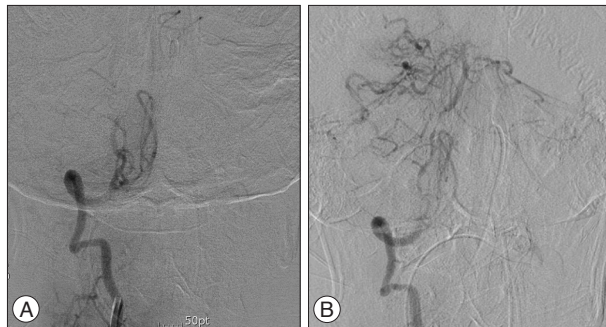
Fig. 2. (A) Preoperative angiographic finding of distal VA occlusion, (B) angiographic finding of long-segment intra-luminal narrowing of the proximal BA and distal VA segment after thrombectomy. BA : basilar artery, VA : vertebral artery.

mRS : modified Rankin Scale, NIHSS : National Institute of Health Stroke Scale