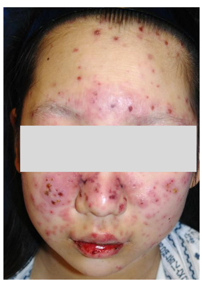
Fig. 1. Multiple diffuse erythematous papules, pustules, and patches with edema were on the face and scalp.

HSV Ig M of serum was positive, while HSV Ig G of serum and HSV PCR of the skin biopsy were negative.