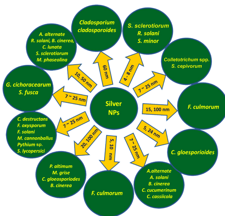
Fig. 3. Illustration of some fungal pathogens that are suppressed by silver, with influential sizes of nanoparticles (NPs).

Silver NPs have been used against different fungal plant pathogens and their suppressive effects on growth and structures of fungi have been reported in Alternaria alternata , Rhizoctonia solani , Botrytis cinerea , Curvularia lunata , Sclerotinia sclerotiorum , Macrophomina phaseolina [35], Cladosporium cladosporoides [75]; Alternaria alternata ; Alternaria brassicicola ; Alternaria solani ; Botrytis cinerea ; Cladosporium cucumerinum ; Corynespora cassicola ; Cylindrocarpum destructans ; Didymella bryoniae ; Fusarium oxysporum f. sp. cucumerinum .; F. oxysporum f. sp. lycopersici ; F. oxysporum ; Fusarium solani ; Fusarium sp; Glomerella cingulate ; Monosporascus cannonballus ; Pythium aphanidermatum ; Pythium spinosum ; Stemphylium lycopersici [37]. Golovinomyces cichoracearum , Sphaerotheca fusca [38]; Colletotrichum spp. also; Sclerotium cepivorum [76];