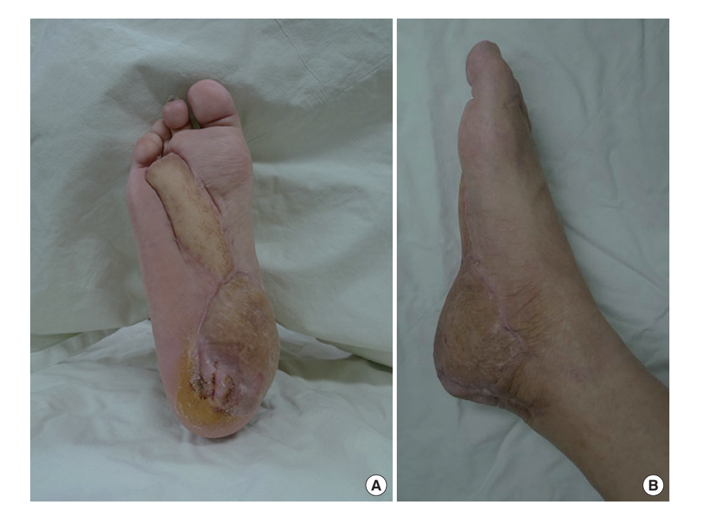
Fig. 3. (A, B) Result at postoperative 10 months. Both flaps completely survived and withstood the daily stress of walking. The normal foot contour was also preserved.

This procedure is disadvantaged by the high level of difficulty and the risk of prolonged general anesthesia because of the long operation time. For these reasons, we recommend that surgeons try this technique after considerable experience with local or