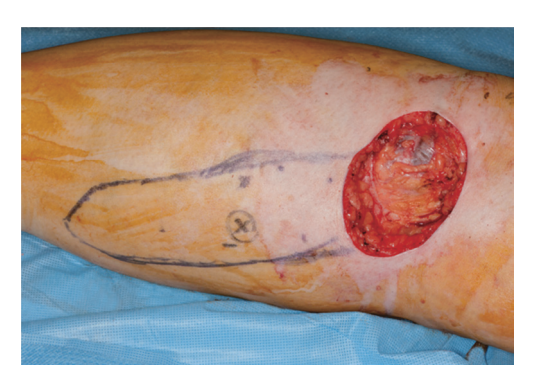
Fig. 1. Wide local excision of malignant melanoma left popliteal fossa with resulting 5 cm × 5.5 cm defect. V-Y advancement flap designed based on a dominant perforator marked with an X.

Use of the pedicled medial sural artery perforator (MSAP) fasciocutaneous flap has been widely reported in the literature for ipsilateral lower limb reconstruction. Depending on defect location, the MSAP flap may be utilized as a propeller or V-Y advancement flap [1]. This perforator flap is typically based on the proximal perforator of the medial sural artery supplying the gastrocnemius muscle. One of the main issues encountered when performing an MSAP flap is venous congestion [2], a commonly described complication in other perforator based flaps [3]. We describe a useful technique to overcome this problem by including the superficial vein into the original flap design. A 57-year-old woman was referred to our department with a malignant melanoma in the left popliteal fossa. Histologically the lesion was reported as having a 0.8 mm Breslow