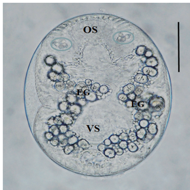
Fig. 1. A metacercaria of Echinostoma hortense found in Odontobutis platycephala in Munsancheon, Paju-si, Gyeonggi-do, which is elliptical and 156 × 108 μm in average size, has 2 suckers, a head crown with 27 collar spines including 4 corner ones (encircled) in each end, and 2 rows of excretory granules (EG).

Diplostomum spp. mesocercariae (=diplostomula) were detected in fishes from all surveyed areas in water systems of Hantangang and Imjingang. Their infection status by the fish species and surveyed areas are shown in Tables 1 and 2.