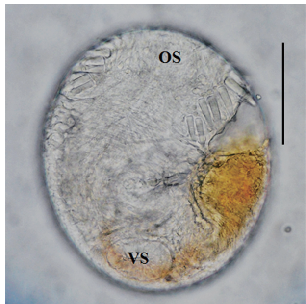
Fig. 3. A metacercaria of Stephanoprora sp. detected in Z. platypus from Seokjangcheon in Yeoncheon-gun, Gyeonggi-do, which is elliptical, 128×98 μm in average size, has 22 color spines interrupted in the dorso-median of oral sucker, minute excretory granules and yellowish pigment. Scale bar is 50 μm.