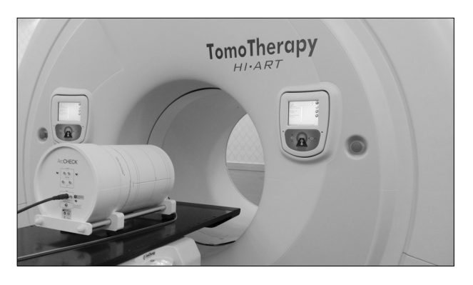
Fig. 3. Dose measurement with ArcCHECK for the TomoTherapy delivery quality assurance (DQA).