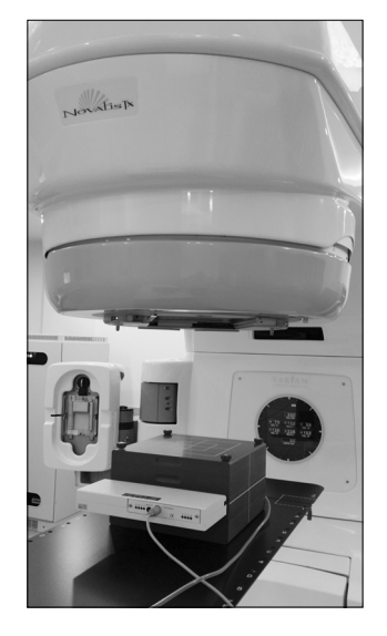
Fig. 4. MapCHECK combined with MapPHAN phantom for the dose measurement in RapidArc treatment.

The additional ten RapidArc plans were prepared with the same MapCHECK phantom, target, OARs and dose prescription as used in the TomoTherapy plans. The DQA plans were prepared for dose measurement by using the ArcCEHCK. After the DQA accuracy was confirmed, the measured dose data by using the ArcCHECK was imported to 3DVH for 3D dose calculation in the MapCHECK phantom. The calculated 2D coronal dose distribution at the level of MapCHECK diode detector array was exported, as in the case of the Tomo-Therapy analysis. The dose difference between the dose meas-