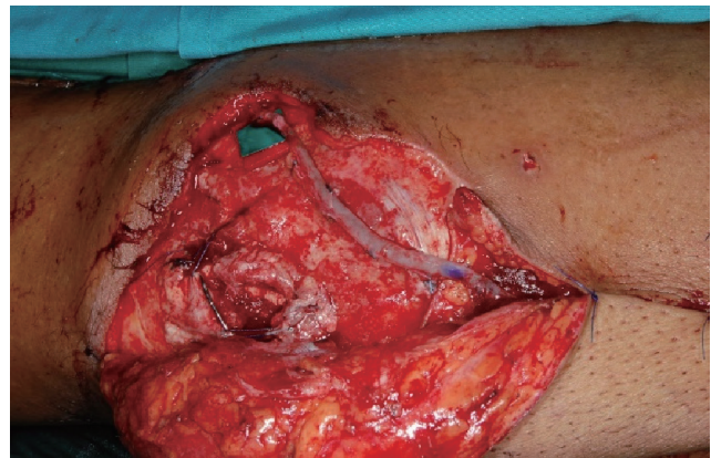
Fig. 3. The great saphenous vein was mobilised to the descending lateral circumflex vein so an anastomoses can be formed after flap transposition.