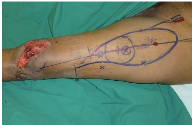
Fig. 1. We planned to preserve a skin bridge in the distal flap, the pivot point for rotational transposition, which acted as a channel for venous outflow.

The distally based anterolateral thigh flap is one anatomical variant of the versatile regional flap commonly employed to reconstruct large knee defects [1]. Venous congestion poses a common concern for such flaps as oedema can potentiate complications such as tip necrosis and eventually scar development. To limit loss of mobility secondary to scarring in the knee, the surgeon should take a preventative approach and optimise venous drainage when utilising anterolateral thigh flaps. We present a case combining two manoeuvres, the