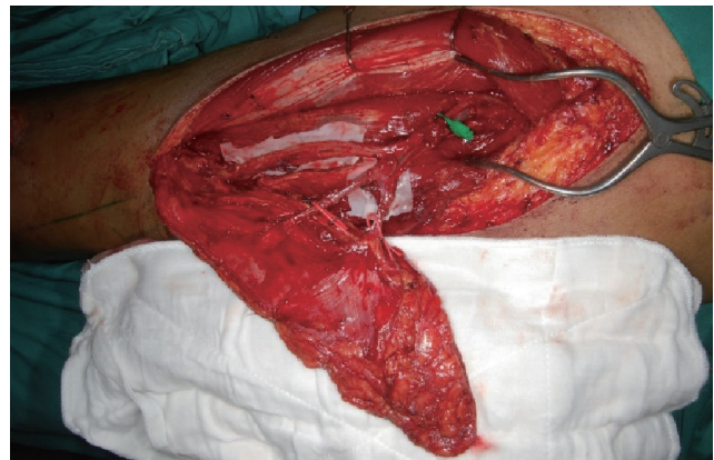
Fig. 2. Two cutaneous perforators were identified and shown to be strongly pulsatile even after the descending branch was clamped proximally.

Two manoeuvres were employed in this case to improve venous drainage; the first was a racket-shaped design which gently tapered