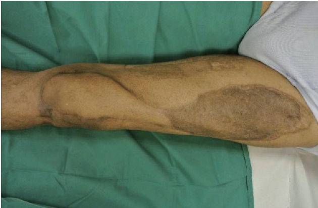
Fig. 4. At two year follow-up the defect has been closed with little overlying tension and minimal scarring allowing for acceptable range of movement. Minor scar revision of the dog-ear over the pivot point of the flap had been done.

into a short “handle”. This was a full-thickness skin bridge at the pivot point where the proximal flap was rotated 180 degrees downward towards the recipient site. The bridge acted to offer cutaneous and subcutaneous continuity and maintained an intact subdermal plexus to serve as additional channel for venous drainage [2]. After the flap was transposed to the knee, a vein graft was utilised to connect the descending femoral circumflex vein to the great saphenous to further augment drainage [3].