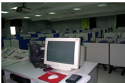
<Figure 2> A innovation language classroom in learning engineering