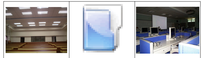
<Figure 3> Product engineering - language classroom, traditional classroom, network study etc.