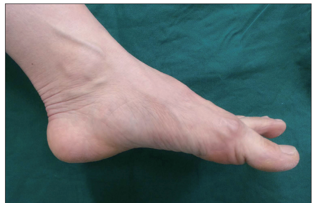
Fig. 1. Foot photography showing muscle atrophy, high arch, and clawed toes.

formity (muscle atrophy, high arch, and clawed toes) (Fig. 1). MRI of the lumbar spine showed LDH at L4–5 (Fig. 2). Her neurological status and symptoms were not correlated with L5 radiculopathy. To obtain a differential diagnosis, we performed further examinations. To evaluate neuropathy or myopathy, we performed an electrophysiological study. Electrophysiological findings were consistent with chronic peripheral motor-sensory