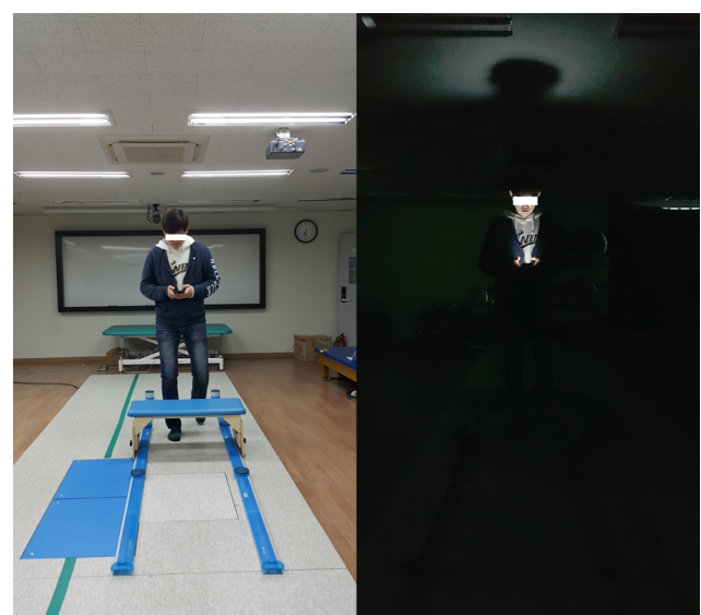
Figure 1. Texting and gaming on gait while walking with an obstructions under different illumination levels.

The experiment was performed inside a flat lecture room in Sahmyook University. Testing conditions included: 1) Walking with an obstruction under a bright illumination level; 2) walking with an obstruction with a low level of illumination; 3) walking with an obstruction while texting under a bright illumination level; 4) walking with an obstruction while texting with a low level of illumination; 5) walking with an obstruction while gaming under a bright illumination level; and 6) walking with an obstruction while gaming with a low level of illumination. All participants were asked to text the Korean national anthem by their own phone and play Temple Run 2 (Imangi Studios, Raleigh, NC, USA) using an iPhone 5 (Apple Inc., Cupertino, CA, USA). Participants began texting and gaming just before they began walking. To minimize light adaptation, dark and light shades were applied correspondingly. Gait variance was measured for a length of 3 m, excluding the 1 m walked before and after the tested area. The experiment value was the mean value after three trials for each subject. To measure the data, a gait analyzing tool (OptoGait, 2010; Microgate Srl, Bolzano, Italy) was used. The analyzing tool contained two transmitters, a 1 m receptor stick, and a webcam (Logitech