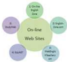
(Figure 3) On-line Web Site

These online learning sites provide quantitative and qualitative English learning materials. These sites commonly include Study Zones, Quick Reference, Support This Site, Fun and Humor as well as chat room, message box, vote box, including a guest book. Moreover, the Study Zone consists of English education information and quizzes, and the lower section consists of Grammar Zone, Idioms Zone, Study Skills Zone, Reading Zone, Writing Zone, Vocabulary Zone, Spelling Zone, Conversation Zone, and a subsection of Teacher Zone.