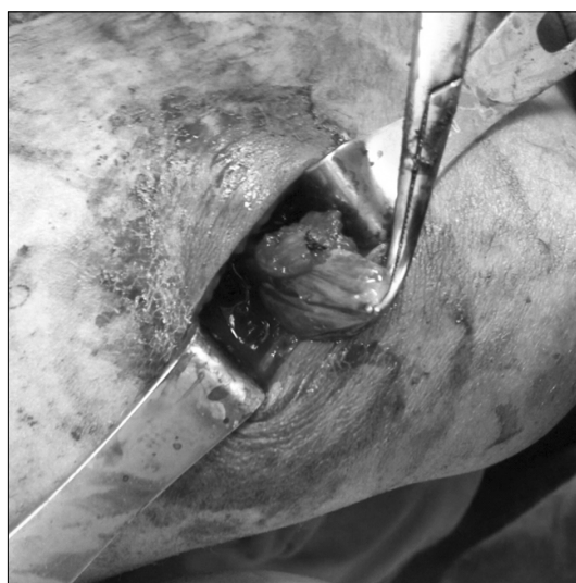
Fig. 3. Intraoperative finding of a pseudoaneurysm after ligation of the feeding arteries.

is necessary and exposure to radiation cannot be avoided. MRI has similar characteristics to CT, but has the advantage of avoiding radiation exposure. Angiography was historically considered the gold standard, but it was also considered to be more invasive than other imaging modalities. Angiography is currently used in the treatment of pseudoaneurysm for embolization and stent insertion [1,2,5,6].