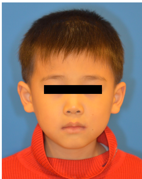
Fig. 3. Extraoral photograph 1 week after treatment of sodium hypochlorite complications.

The next day, as the clinical symptoms were aggravated after tooth extraction, the patient revisited our hospital. The patient was immediately referred to an oral surgeon, and was hospitalized for further treatment. At the first day of hospitalization, antibiotics (amoxicillin clavulanated), and analgesics (ketorolac) were administered intravenously. From the second day of hospitalization, the type of antibiotics (cefotiam) was changed but the type of analgesics was the same. The facial swelling and ecchymosis gradually diminished from the second day, the patient was discharged on the fifth day of hospitalization. Although mild swelling was left on the buccal area, there was no pain on palpation of the affected region and the bluish color of the ecchymosis area faded.