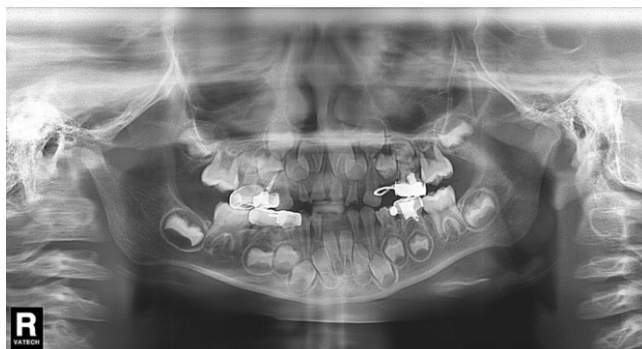
Fig. 5. Panoramic view 1 year after treatment.

canal irrigant. There is no general agreement about its optimal concentration; it is used over a range from 0.5% to 5.25%. Its antibacterial and tissue dissolution actions increase with concentration, as does its toxicity 4-8 .