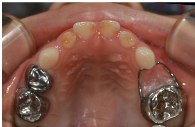
Fig. 4. Intraoral photograph after band and loop delivery.

Sodium hypochlorite is most frequently used as a