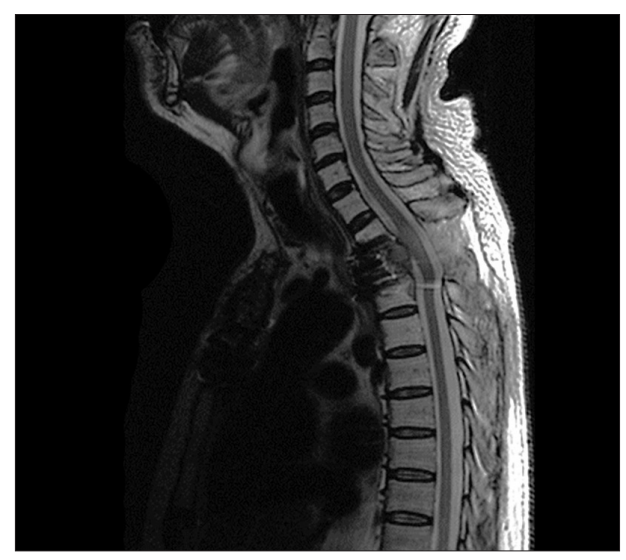
Fig. 5. Postoperative MR imaging shows corpectomy and reconstructed states at the T2 level.

amination revealed decreased senses of touch, pain, and changes in proprioception. Motor weakness of grade 3 with clonus and hypereflexia were present in the lower extremities. MRI of the cervicothoracic spine showed a fungating tumor within the T2 vertebral body extending to the pedicle and lamina. The SPL was -43.2 mm from the sternal notch and the IPL was -10.2 mm. The SPL-angle was 33.9°, and the IPL-angle was 8.3°. As the angle of SPL was steeper than IPL due to kyphotic deformity of lesion, two lines were crossing in the mediastinum (Fig. 4). This deformation makes difficulty of visualization and manipulation at the posterior superior corner of the T2 vertebrae during the operation, despite sufficient length of the manubriotomy. The main barriers were anterior lower corner of the T1 vertebra and great vein not the osseous window. This case well illustrates that the SPL is more important than the IPL. Decompression with corpectomy and reconstruction with a titanium mesh cage was done. The remaining tumor in the posterior column was removed through the second posterior approach 1 week later, and the pedicle screw was augmented. The patient's pain and neurological symptoms was improved markedly after surgery and postoperative MRI shows decompression of cord (Fig. 5).