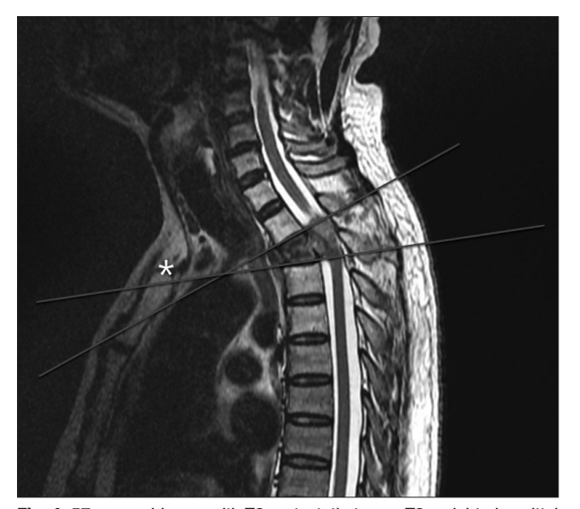
Fig. 4. 57 years old man with T2 metastatic tumor. T2 weighted sagittal image shows tumor within T2 vertebral body distorting the cord.

amination revealed decreased senses of touch, pain, and changes in proprioception. Motor weakness of grade 3 with clonus and hypereflexia were present in the lower extremities. MRI of the cervicothoracic spine showed a fungating tumor within the T2 vertebral body extending to the pedicle and lamina. The SPL was -43.2 mm from the sternal notch and the IPL was -10.2 mm. The SPL-angle was 33.9°, and the IPL-angle was 8.3°. As the angle of SPL was steeper than IPL due to kyphotic deformity of lesion, two lines were crossing in the mediastinum (Fig. 4). This deformation makes difficulty of visualization and manipulation at the posterior superior corner of the T2 vertebrae during the operation, despite sufficient length of the manubriotomy. The main barriers were anterior lower corner of the T1 vertebra and great vein not the osseous window. This case well illustrates that the SPL is more important than the IPL. Decompression with corpectomy and reconstruction with a titanium mesh cage was done. The remaining tumor in the posterior column was removed through the second posterior approach 1 week later, and the pedicle screw was augmented. The patient's pain and neurological symptoms was improved markedly after surgery and postoperative MRI shows decompression of cord (Fig. 5).