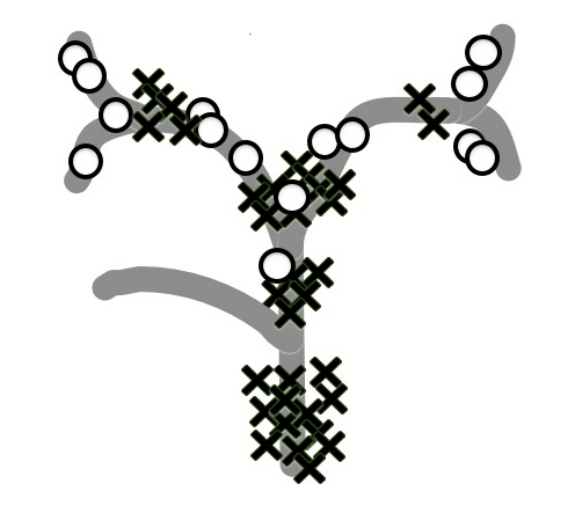
Figure 2. Tumor Locations. The sites of the main tumors are shown by open circles (occupational group) or by crosses (sporadic group). Two patients with both intrahepatic and extrahepatic tumors are not shown in the figure