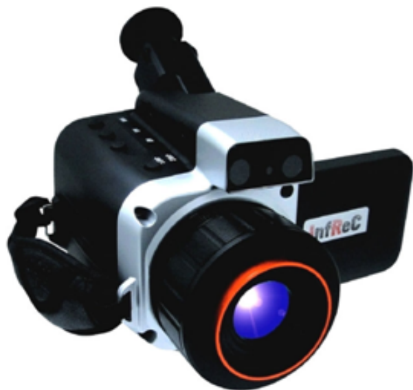
Figure 1. Figure of thermography device R500 (taken from device)

In this study, after receiving and recording the patient's history, the results of the clinical examination along with the ultrasound and biopsy stereotypes and images of thermography were examined separately by the respective specialists. After recording the results, and considering the clinical symptoms, Capabilities of thermography